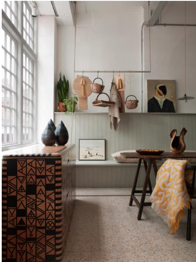
A selection of works from Contemporary Living: Art, Craft & Design

EXHIBITION OF CONTEMPORARY ARTISTS, DESIGNERS & CRAFTSMEN AT CHRISTIE'S WITH THE NEW CRAFTSMEN & SOUTHERN GUILD