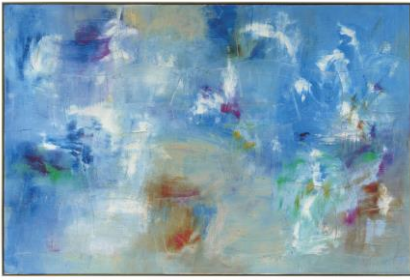
Dan Rees (B. 1982) Artex Painting oil on canvas Painted in 2013 Estimate: £20,000-30,000