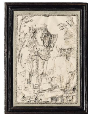
Pablo Bronstein (B. 1977) Large Urn with Admirers ink on paper, in artist's frame Executed in 2007 Estimate: £3,000-4,000