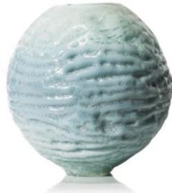
Edmond Byrne (B. 1977) 'Jade Moonjar' , a vase, 2016 cased moulded glass Estimate: £4,000-6,000