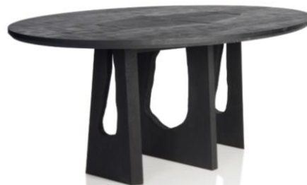
Sebastian Cox (B. 1986) A unique 'scorched' dining table , 2017 scorched ash, the oval top on three pierced trestle supports Estimate: £6,000-9,000