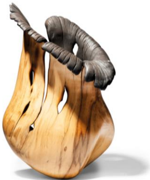
Nic Webb (B. 1972) A 'LOST VESSEL' , 2015 Boxwood Estimate: £4,500-6,500